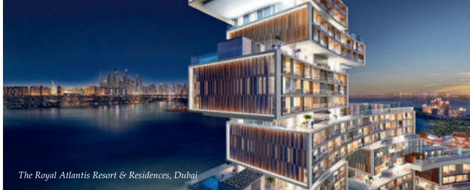
The Royal Atlantis Resort & Residences, Dubai